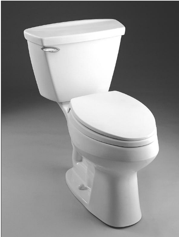
CST733F - Dalton Close Coupled Toilet with SS114 - SoftClose Seat