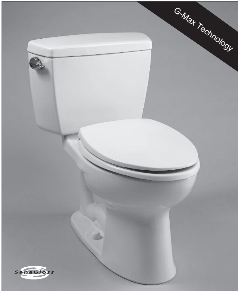
CST744S(G) - Drake Close Coupled Toilet with SS114 - SoftClose Seat